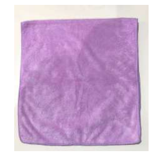
We use a fluffy and highly absorbent microfiber material for bathing towels.