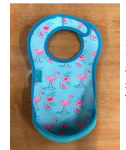
Bibetta bib with excellent water absorption and quick drying. Easy size adjustment with Velcro, can be used from 0 to 2 years old.