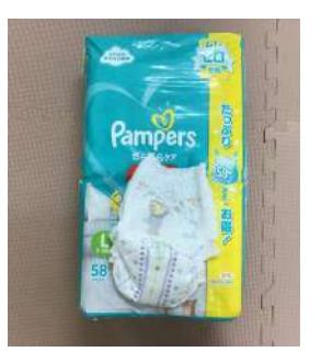
We use Pampers, which has the largest shares in domestic hospitals. It is safe, secure and high quality using the same weak acid used by wet tissues for wiping bare skin.