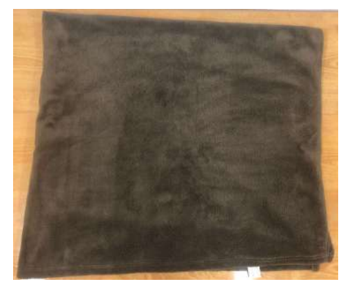
In the Winter we use fluffy microfiber blankets