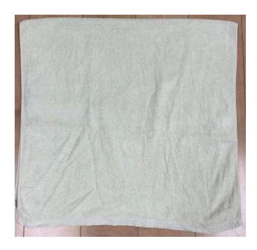
During Spring and Summer we use towelettes.