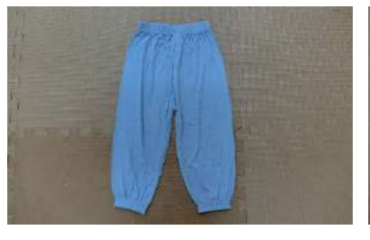
Summer trousers for stroll