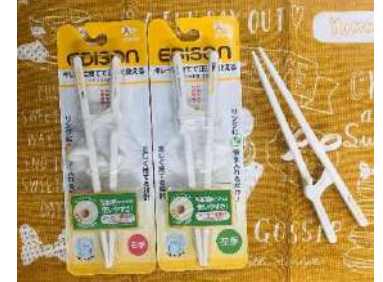
From 1 year old Teaching the children to use chopsticks as they grow up.