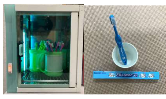
We protect the infants oral health with custom-made baby toothbrushes from a dental contractor, which are disinfected with a specialized sterilizer.

*For uniforms and special supplies our staff members will write the name of the child during the preparation time before the child joins the nursery and will be their personal set. *Even after joining the nursery things such as washing the clothes and disinfectant will all be done at the nursery.