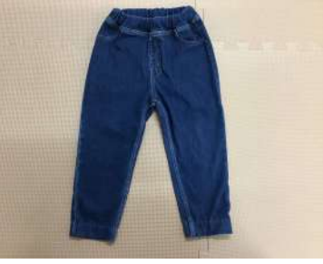
Easy-to-move jeans with outstanding elasticity.